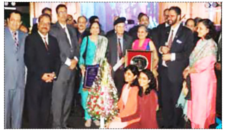
CMMI Conferred on him Lifetime Achievement Award in 2020

Mumbai. He retired as MD, LPA in 1995. After retirement, he was the Managing director of Risk Control Rating Systems , in collaboration with an Australian company, relating to safe working practices of companies. He was a Marine hull underwriter, Insurance consultant, and visiting faculty to numerous institutes. He was also a consultant with CHHUB insurance co. ltd., USA, for over two years.