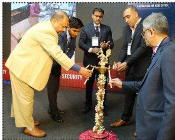
Lightening of Lamp

E astaway (India) Private Limited, a subsidiary of Eastaway Ship Management Pvt Ltd, Singapore, a unit of X-Press Feeders set up their Crew Manning Operation by launching the office at C421, 215 Atrium Building, Andheri East, Mumbai. The new office opening ceremony was clubbed with Officers Seminar held at Radisson Blu Mumbai on 13-14 June 2022.