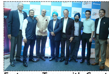
Eastaway Team with Guests during Gala Dinner