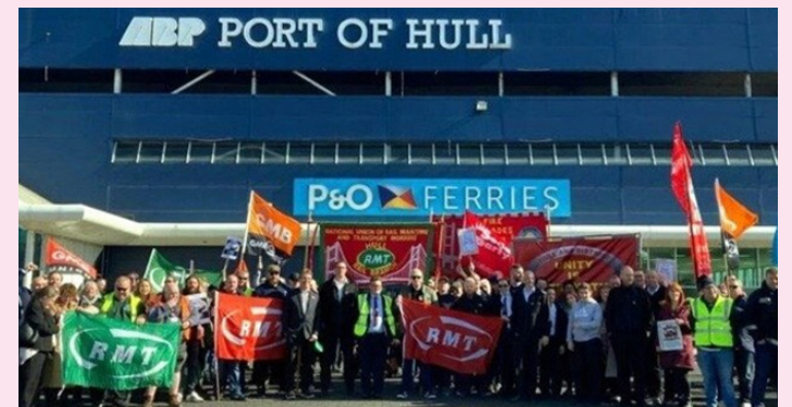
Union members staged numerous protests after P&O's dismissal of 800 crewmembers