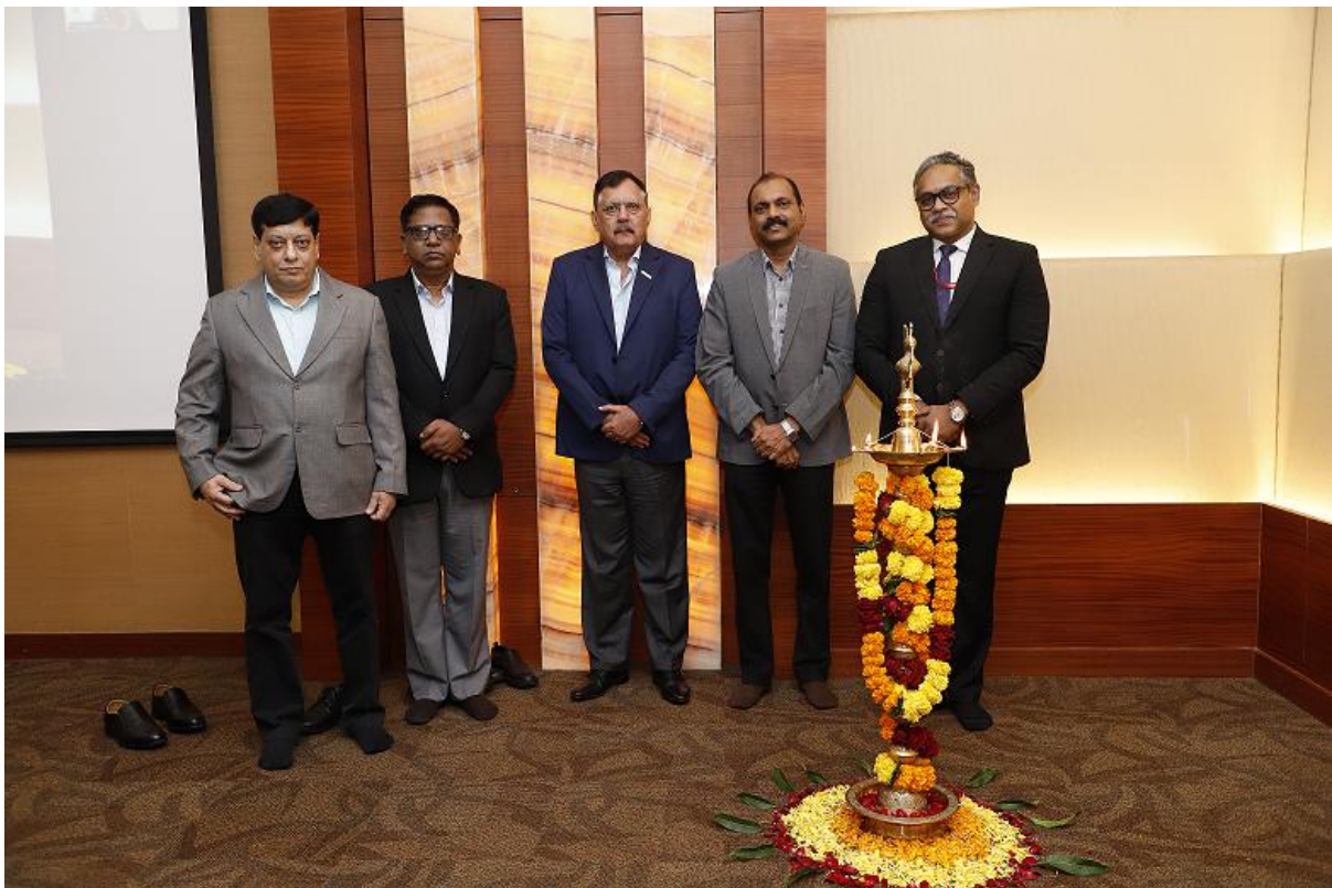
Lighting of Lamp